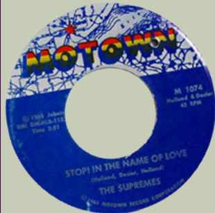
The Supremes: #1 this week in 1965